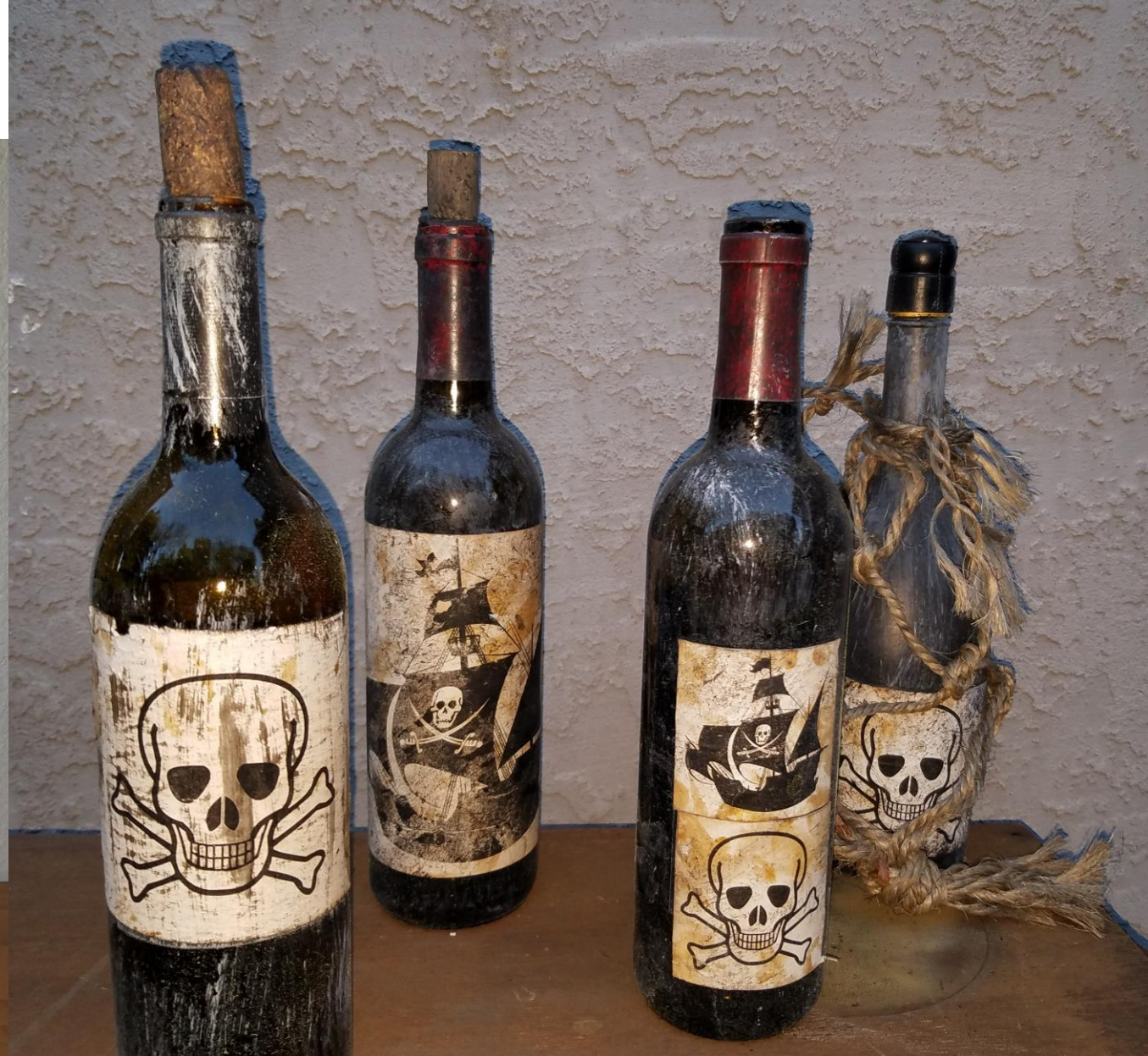
Any labels from the internet...aged with coffee or tea