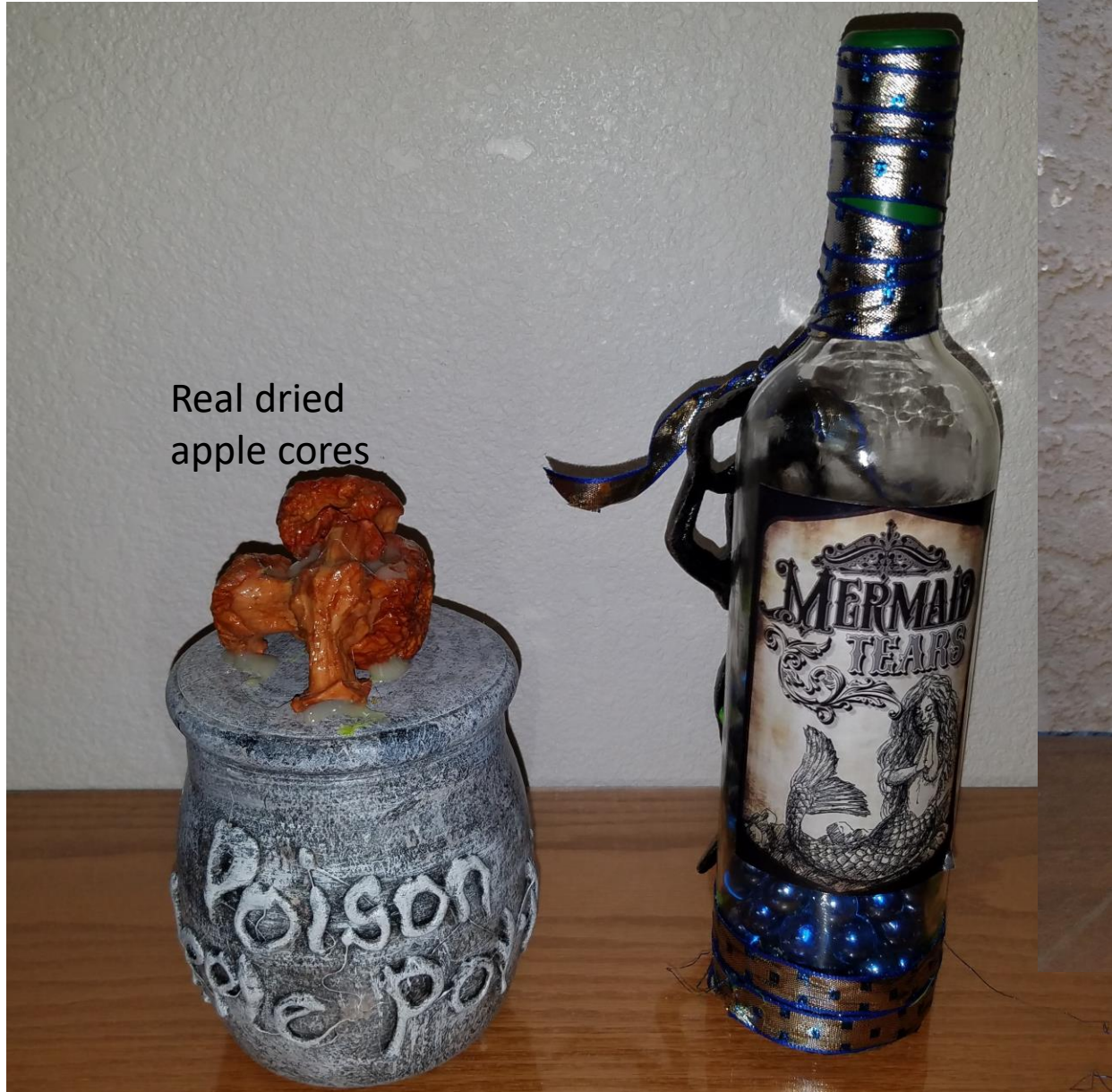
Real dried apple cores